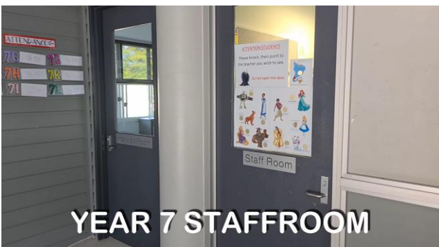
YEAR 7 STAFFROOM